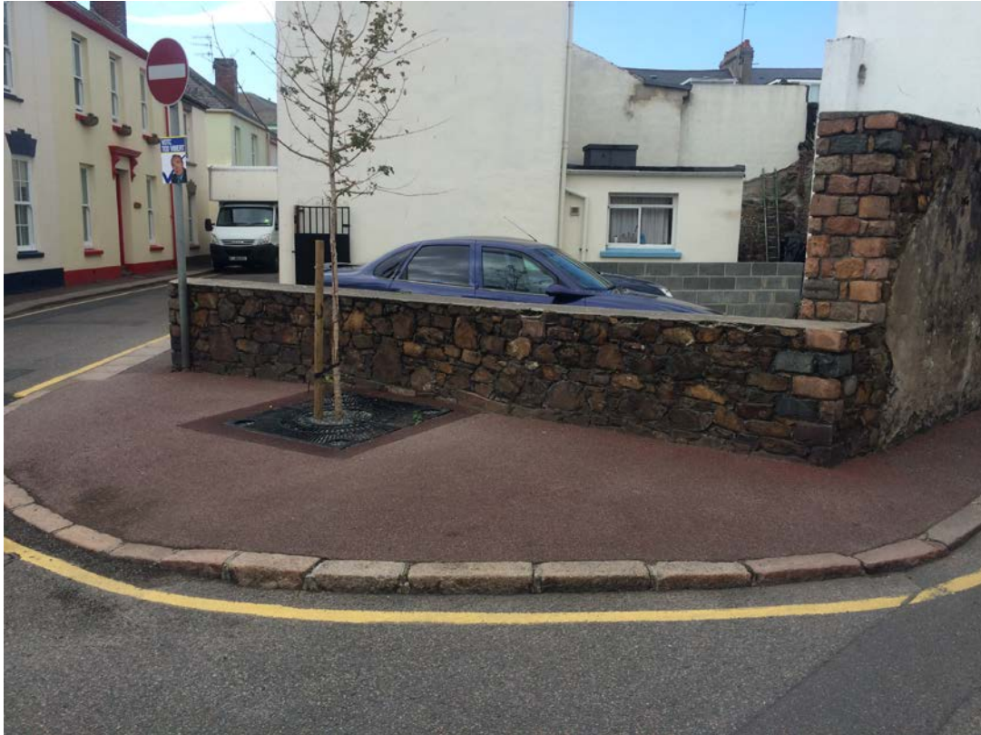
VIEW OF COMMON YARD