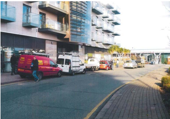
La Rue de L'Étau