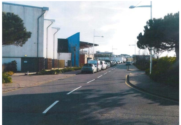
La Rue de L'Étau