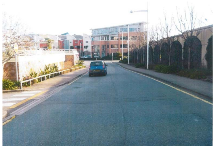
La Rue de L'Étau