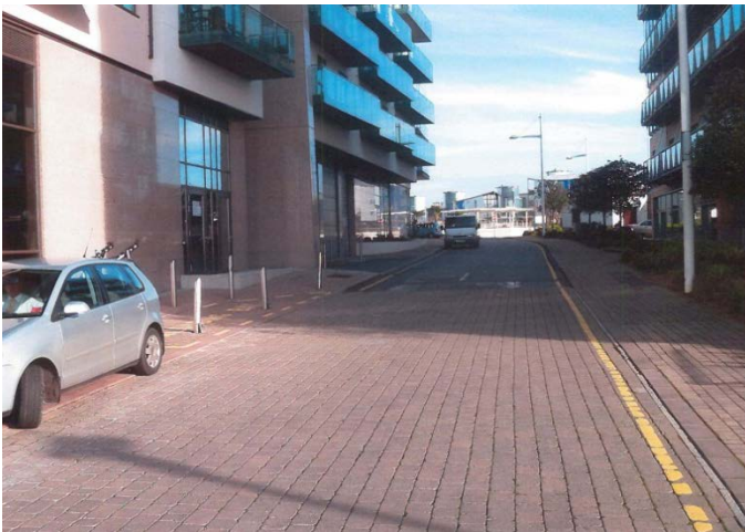
La Rue de Carteret